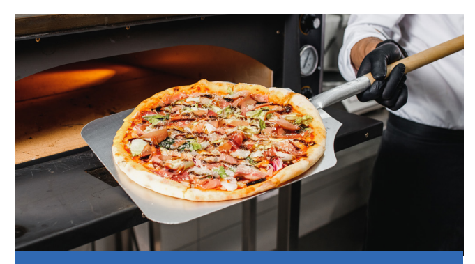
Case Study: Pizza restaurant franchise

Note: Businesses purchased after 1 September 2024 must be outside of South East Queensland. See eligible postcodes on page 1.